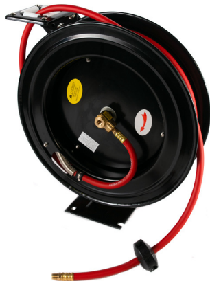
Retractable Air Hose Reel